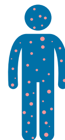
Red, Raised Rash