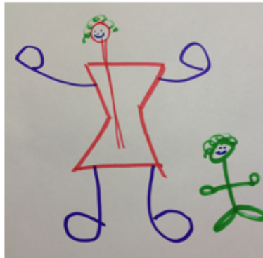
Actual: "Families Unique or Diverse" Guess: "Building Strong Families"