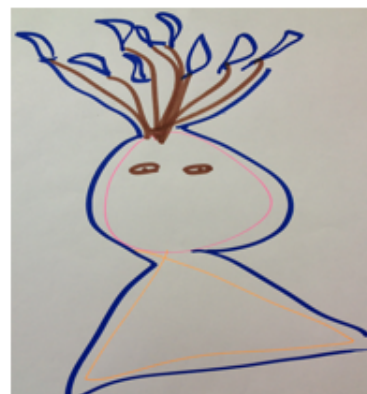
Actual: "Idea Baby" Guess: "Great Start Ideas"

The 11/18/15 Agenda and 10/14/15 Meeting Notes were approved as stated.