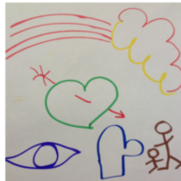
Actual: "Michigan Loves Kids" Guess: "I Love Michigan Families to the Moon and Back"